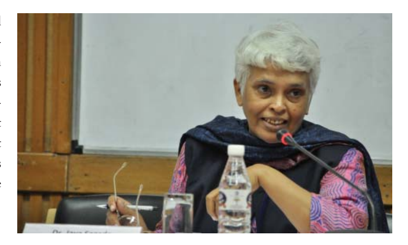
'Early' marriage in comparison to what and for whom?

Across the world, early and forced marriage and child marriage are used to describe the phenomenon of under-age marriage, sometimes even inter-changeably including some United Nations documents.6 Others use the phrase "early marriage, including child marriage," implying that early marriage encompasses child marriage but also includes situations that do not qualify as child marriage, such as marriages in which one or both spouses are below the age of 18 but have attained majority under state laws. UNICEF for example says, "Early marriage, better known as child marriage, is defined as marriage carried below the age of 18 years, "before the girl is physically, physiologically and psychologically ready to shoulder the responsibilities of marriage and child bearing"7