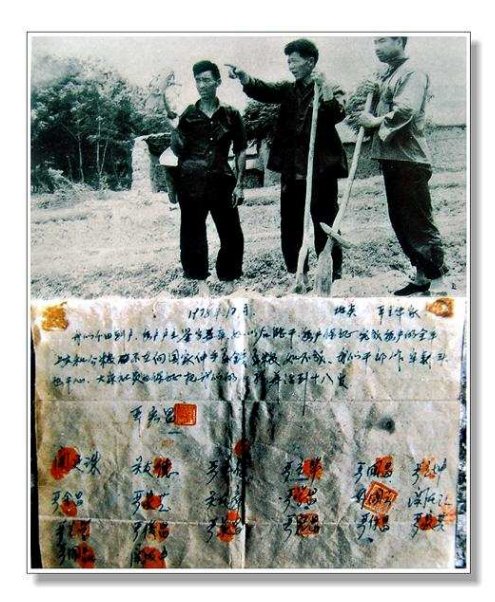
Picture 1 : In 1978, hungry villagers from Xiaogang village, Anhui Province, China, began their way of 'household responsibility system'.

In the early 1980s, the household responsibility system (HRS) was widely adopted as a replacement for the previous system of the people's commune. HRS was first created by a group of devastated hungry peasants (see Photo 1) but spread nationwide with the support of the central government; by 1983 more than 93% of production teams had adopted the system. Under HRS, households were allowed to lease land, and hire machinery and other facilities from collective organisations.<sup>6</sup> In other words, farmland remained owned by village collectives, but the collectives offered leases and contracts to individual households. Individual households could take independent operating decisions within the limits of their lease or contract. After paying a fixed amount to the government, they could freely dispose of surplus production to the market.