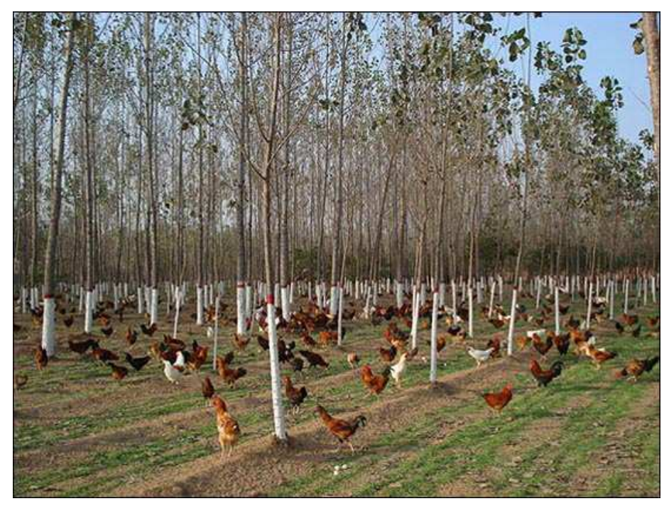
* Integration of poplar wheat-based and poultry in agro-forestry. Siyang County, China.

On the whole, in order to achieve a comprehensive, human centred and sustainable land governance, Chinese people need to continue to develop innovative ideas and technologies, reform institutions, and adjust lifestyles, so as to attune toward environmentally friendly and sustainable methods. It is encouraging that China is