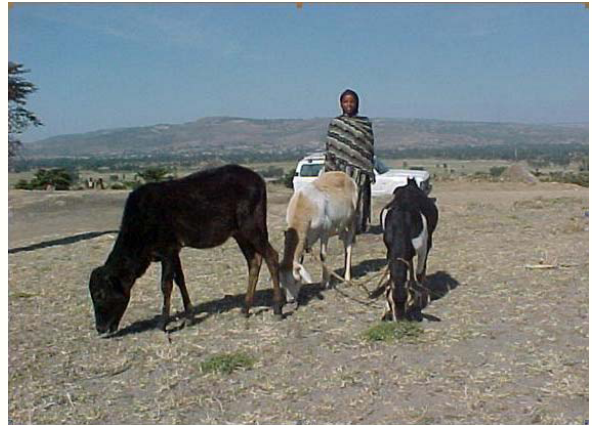
EU Food Security Capacity Enhancement Project – Ethiopia

This short paper outlines a key set of effects and indicators covering expected outcomes and impacts of support to the agriculture and rural development sector. It is designed to assist country teams to develop a set of indicators for the programming level and guide the production of documents such as Country Strategy Papers (CSP). It also aims to fill, as much as possible, the 'missing middle' between implementation indicators (e.g. irrigation of crops) and global impact indicators (e.g. poverty reduction).