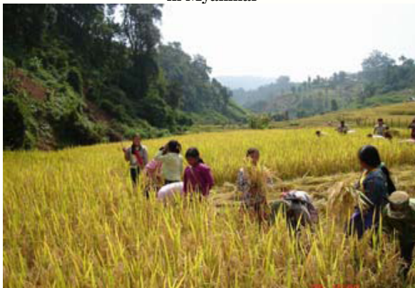
Alternative development in former poppy growing areas in Myanmar