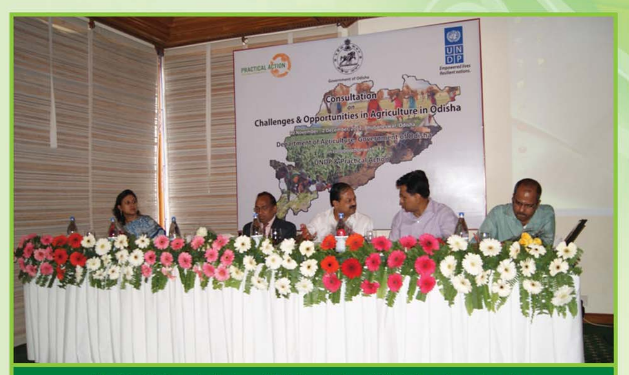
Hon'ble Minister, Agriculture, F&ARD and other officials in a discussing about Challenges and Opportunities in Agriculture in Odisha