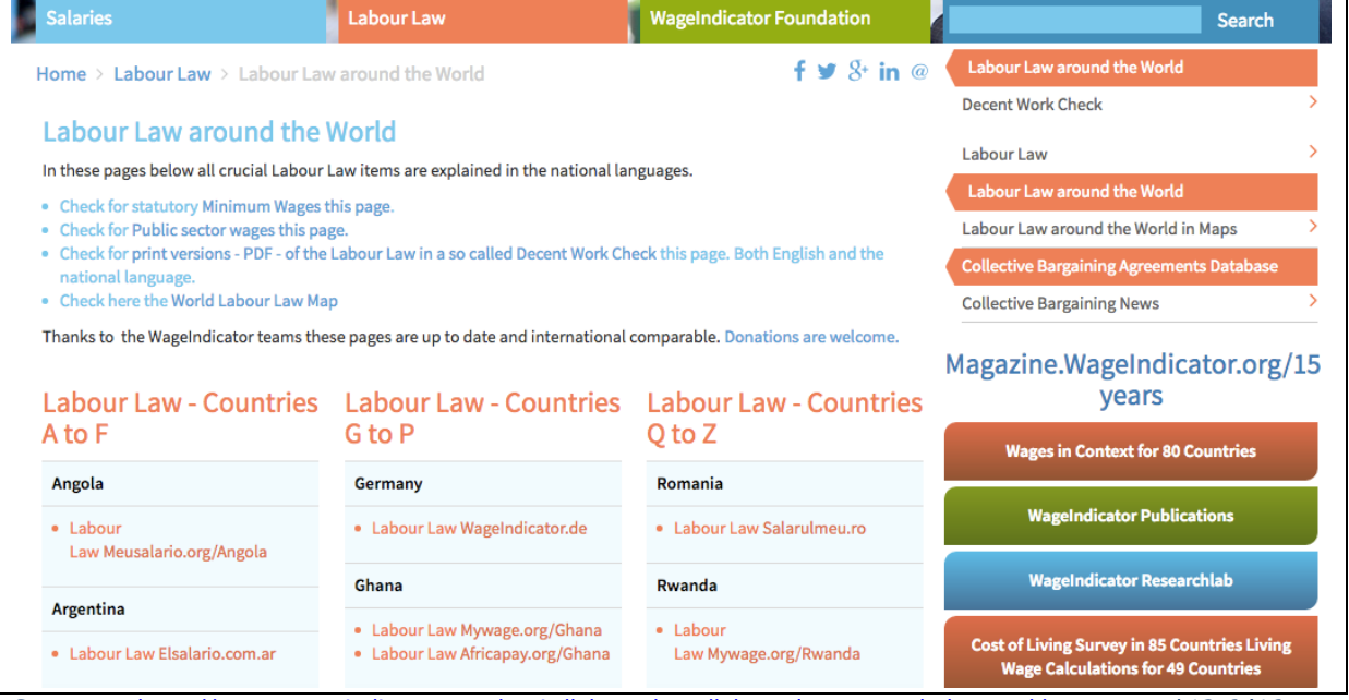
Source <u>http://www.wageindicator.org/main/labour-laws/labour-law-around-the-world</u>, accessed 13-6-'16