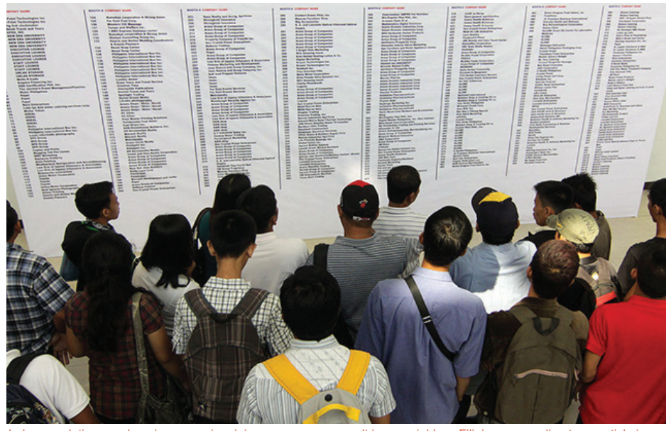
Labor regulations such as increases in minimum wage may result in more jobless Filipinos, according to an article in the book.

Ending temporary employment contracts (TECs), more commonly known as "endo", is generally perceived to result in a higher level of job security for Filipino workers because employed workers shall