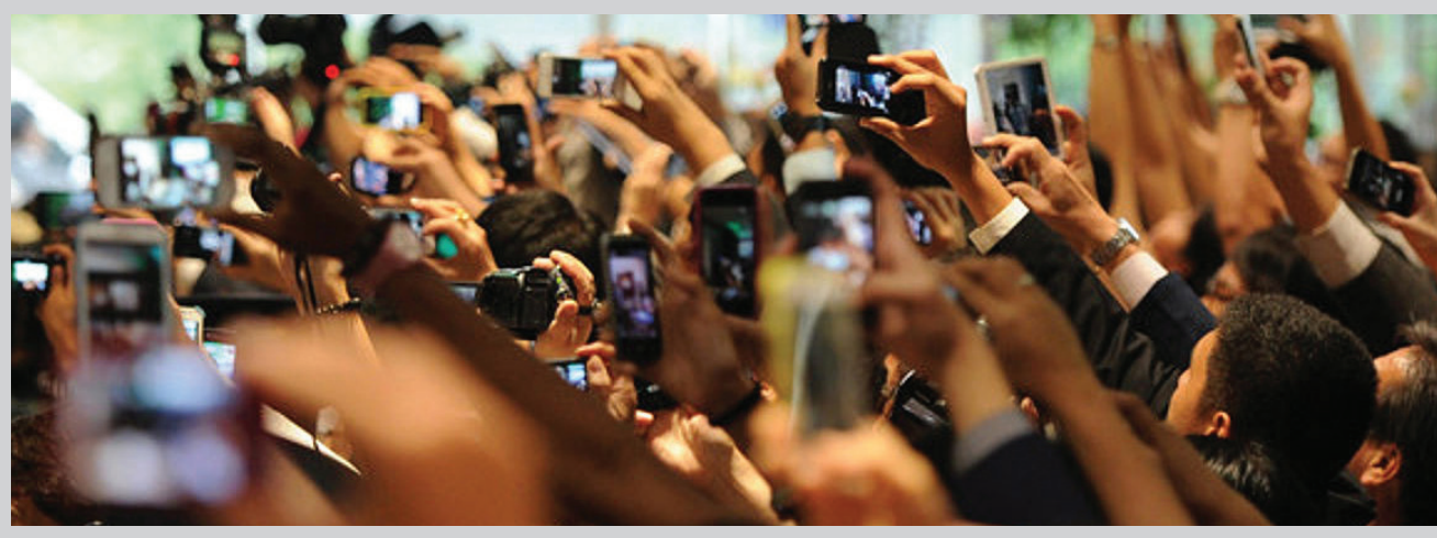
The Philippines' large demand for telecom providers requires a more robust regulatory system.

THE QUALITY OF the Philippine telecommunication regulatory environment is significantly below international standards, according to a recent study of state think tank Philippine Institute for Development Studies (PIDS).