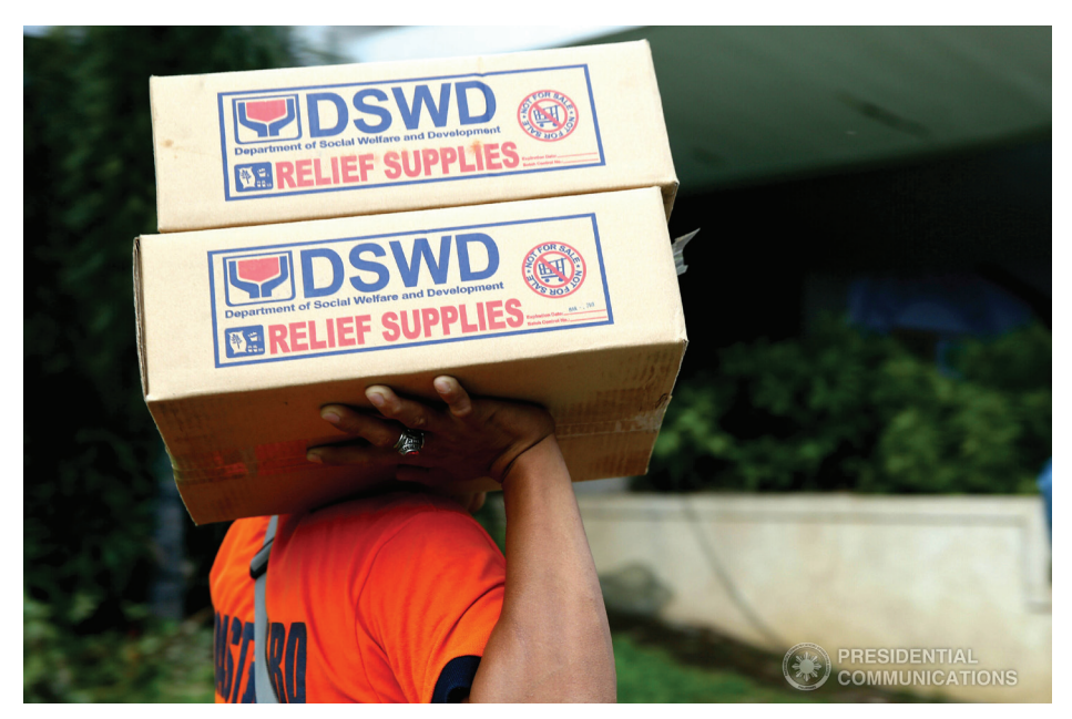
DRRM fund appropriation among NDRRMC member-agencies requires revisiting, the study suggests. Some agencies, such as DSWD, receive more regular funds than others despite having the same level of proactivity and resiliency expectations.