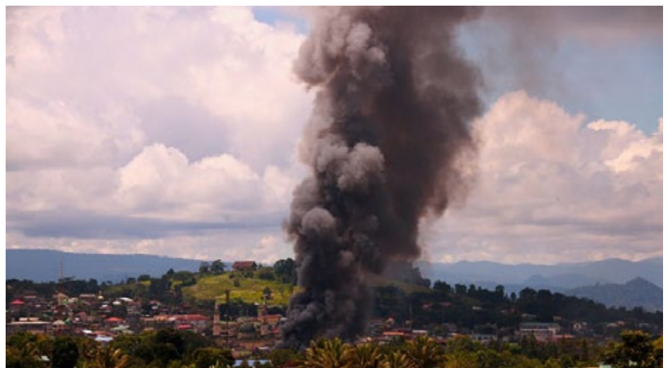
While the recent siege in Marawi has little effect on Mindanao's overall economy, the flow of goods and services to and from neighboring economies was hampered by the extremist events.

According to Arroyo, the ASCC was grounded on the idea that "Southeast Asia must be bonded together as a partnership of caring societies."