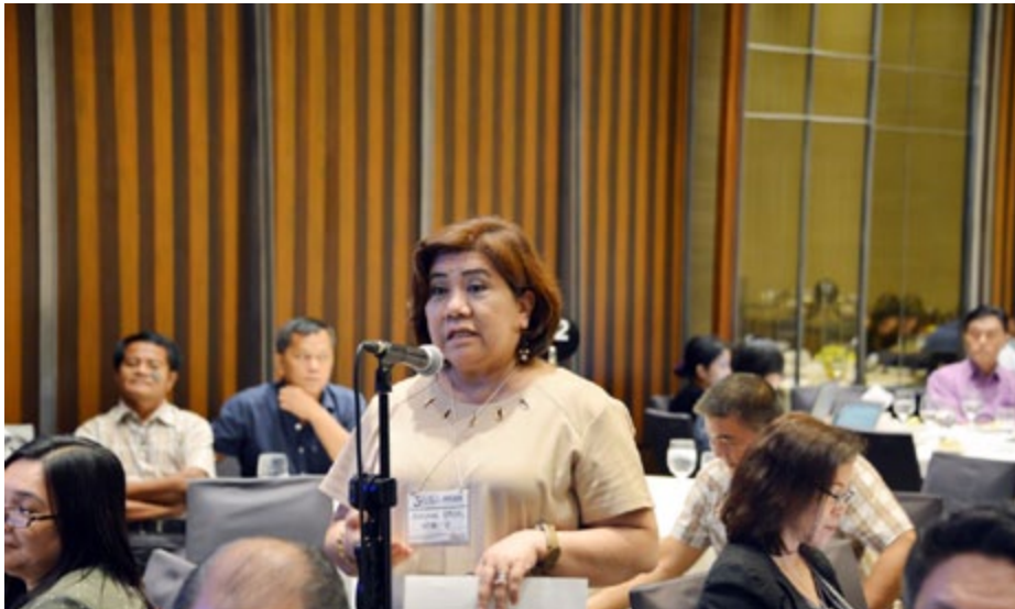
The majority of APPC participants (71%) were not convinced that shifting to federalism translates to sustainable growth and development, the event survey says.

impacts on business and investments, political structures, national identity, and languages.