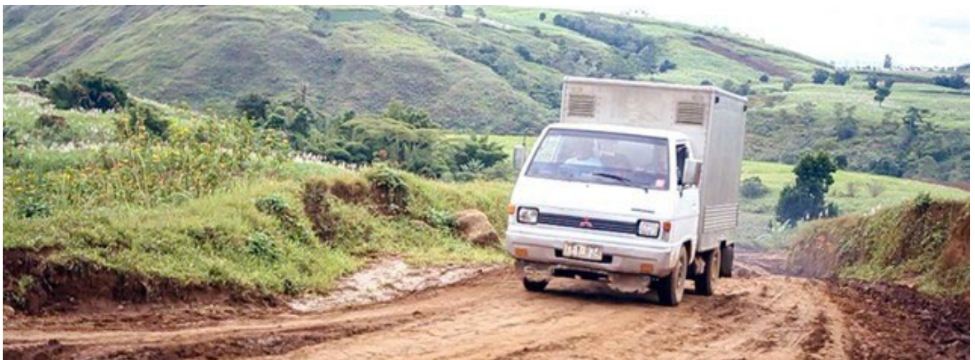
Under a federal form of government, regions with smaller populations may be at risk of underdevelopment due to low income generation.

Pascual also raised the need for the policymakers to define the brand of federalism that the country will adopt. He also encouraged them to consider other issues on federalism, such as its