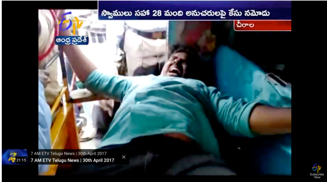
The journalist assaulted in Chirala.

In the period being reported on, 54 attacks on journalists in India were reported in the media, according to the Hoot's compilation. The actual number will certainly be bigger, because last week Minister of State for Home Affairs Hansraj Ahir said during question hour in the Lok Sabha that 142 attacks on journalists took place between 2014-15.