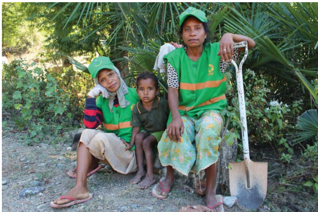
Women community road maintenance workers in Maliana (Bobonaro District)