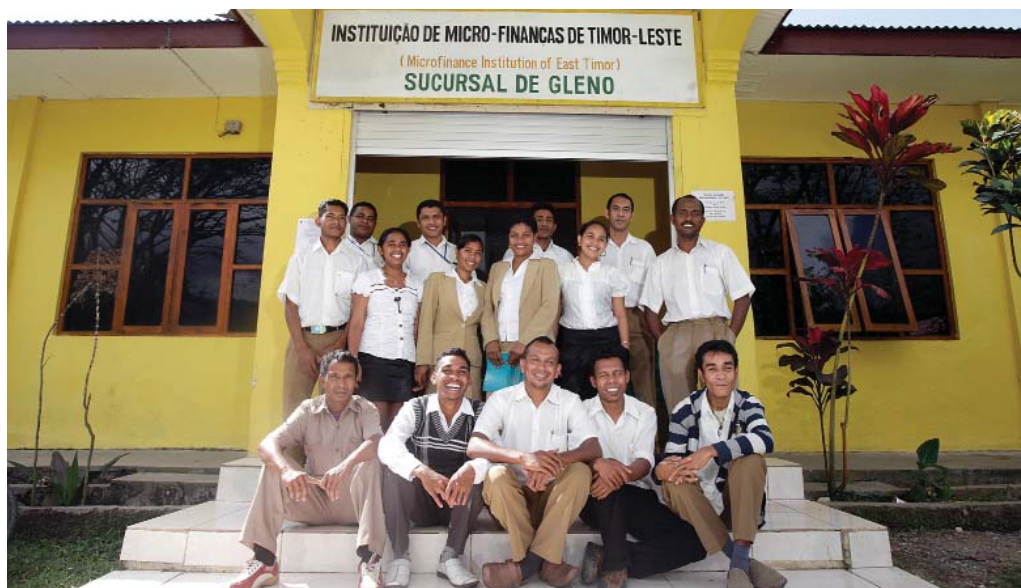
Staff at the Institute for Microfinance Timor-Leste's Gleno branch.

■ The emphasis has been on the needs of small and micro lenders and borrowers, especially in the rural population and among women, to help them participate in economic growth