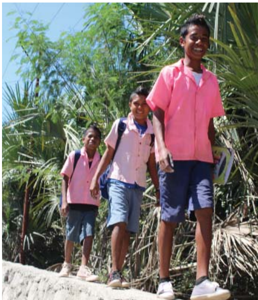
Schoolchildren walking alongside a new road.

The project made travel faster and reduced vehicle operating costs. Surveys indicated that local people were travelling more—to health centers, for example—and more goods were being bought and sold in the project area. Moreover, villagers earned nearly $700,000 from employment on the road works, providing a much-needed additional source of income. The project also tested new approaches to community road maintenance that helped shape ADB's subsequent support for the sector.