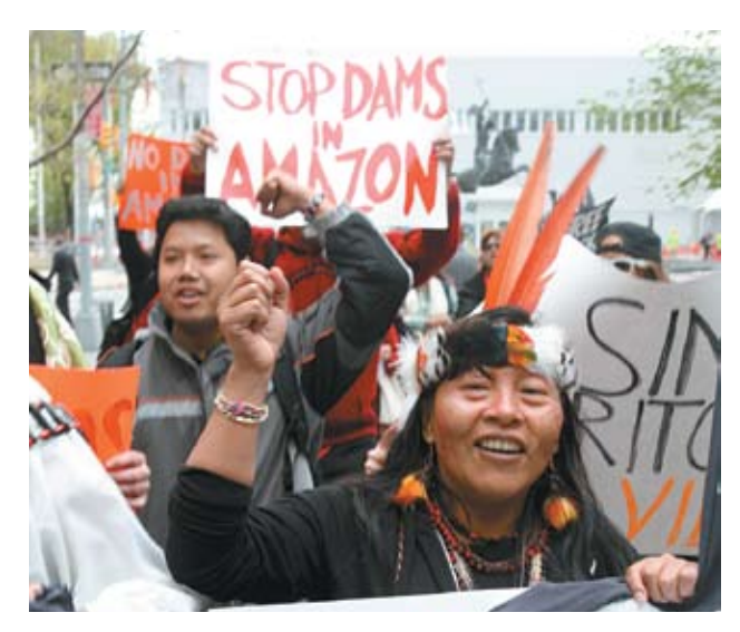
Indigenous people peacefully protest in front of the Brazilian Permanent Mission to the United Nations in New York on in April 2010.

Belo Monte Dam, Brazil: The Brazilian government is planning to build what would be the world's third-largest hydroelectric project on one of the Amazon's major tributaries, the Xingu. The Belo Monte Dam would divert the flow of the Xingu River and devastate an extensive area of the Brazilian rainforest, displacing over 20,000 people and threatening the survival of indigenous peoples. While the project will have an installed capacity of 11,233 MW, the dam would only generate 1000 MW during the 3-4 month dry season. A recent cost analysis revealed a 72% chance that the costs of the Belo Monte Dam will be greater than the benefits. The government has yet to conduct a thorough options assessment for the region, choosing instead to promote the economic and political interests of large dam builders and politicians rather than the rule of law. A 2007 study by WWF-Brazil showed that by 2020, Brazil could cut the expected demand for electricity by 40% through investments in energy efficiency, with national electricity savings of up to $19 billion. The power saved would be equivalent to 14 Belo Monte hydroelectric plants.