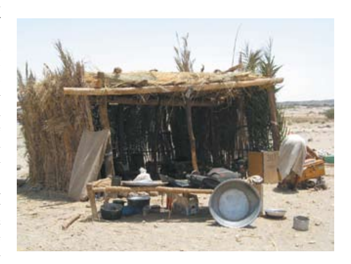
The temporary camp for Merowe Dam affected people.

Merowe Dam, Sudan: With a planned capacity of 1,250 MW, the Merowe Dam in northern Sudan is the largest hydropower project currently under construction in Africa. The dam will displace up to 70,000 people from the fertile Nile Valley to arid desert locations. The project is being built by Chinese, German and French companies, with financing from the China Exim Bank and Arab financial institutions. In May 2007, the affected people reached an agreement with the government of Sudan's Nile State that gave them the right to relocate to settlements along the reservoir. Yet this agreement has never been honored, and the powerful Dam Implementation Unit, which sits directly under the Sudanese president, has waged a relentless campaign to drive the affected people off their lands. The dam authority sent armed militia to suppress local protests in several instances, including killing three people and injuring many more in a massacre in April