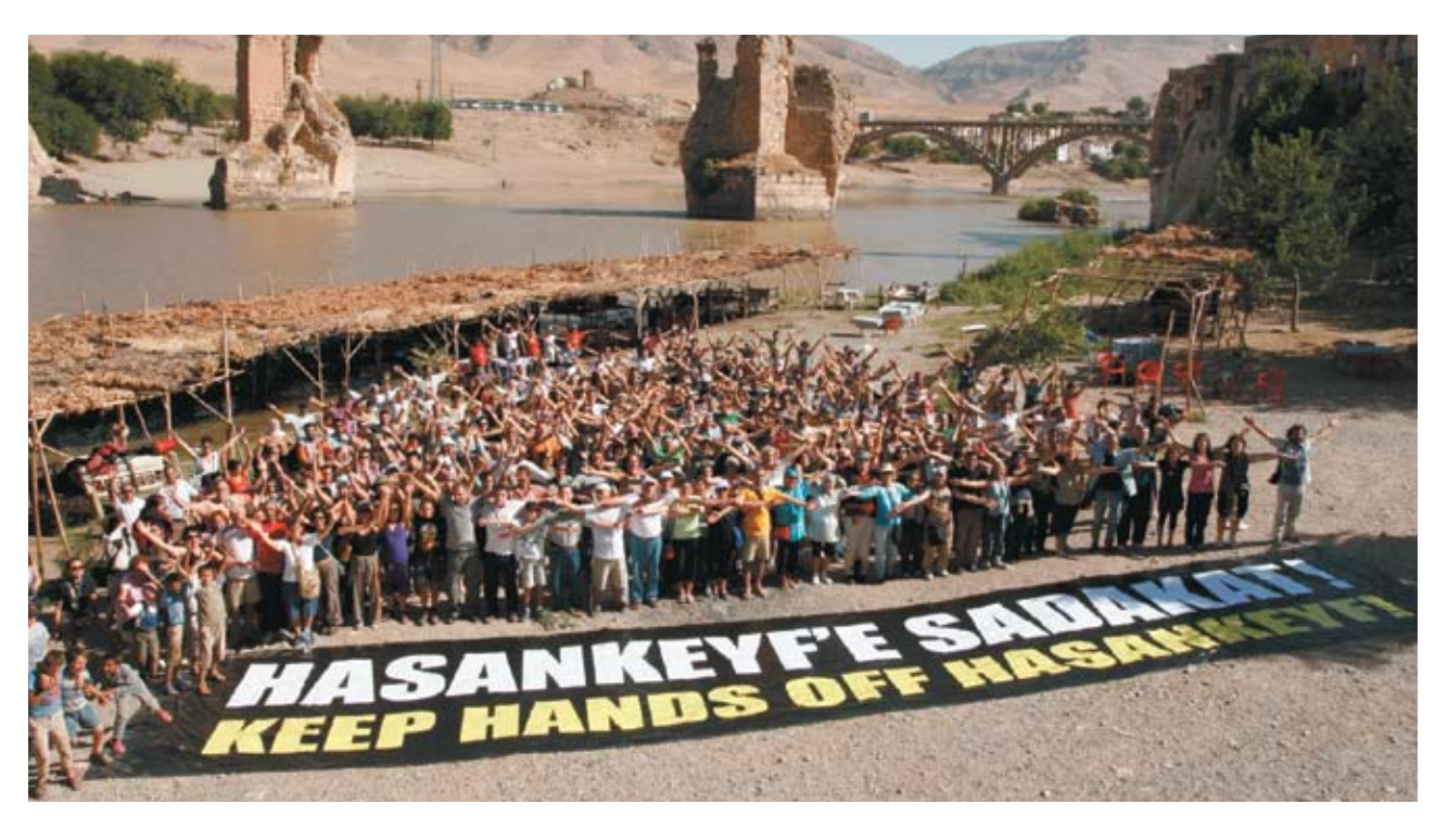
The ancient town of Hasankeyf will be flooded by the Ilisu Dam, but local and national groups are fighting tirelessly to keep it safe.

fair use of the Tigris. But a fact-finding mission in 2007 found that Iraq had not agreed to the proposed dam and that no negotiations had taken place between Turkey, Syria and Iraq on Ilisu. Because of the serious and unsolved environmental, social and cultural heritage problems and the strong opposition in their home countries, European funders pulled out of the Ilisu Dam in 2002 and again in 2009. The Turkish government says it plans to continue construction of the Ilisu Dam.