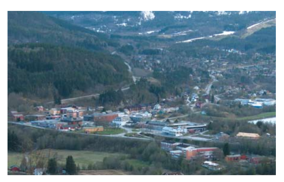
Every summer, hundreds of fishermen come to the Surna River, which runs through the valley in Surnadal, to fish for salmon.

Clark Fork Project, US: The 697 MW Clark Fork Project includes the Noxon Rapids Dam and the