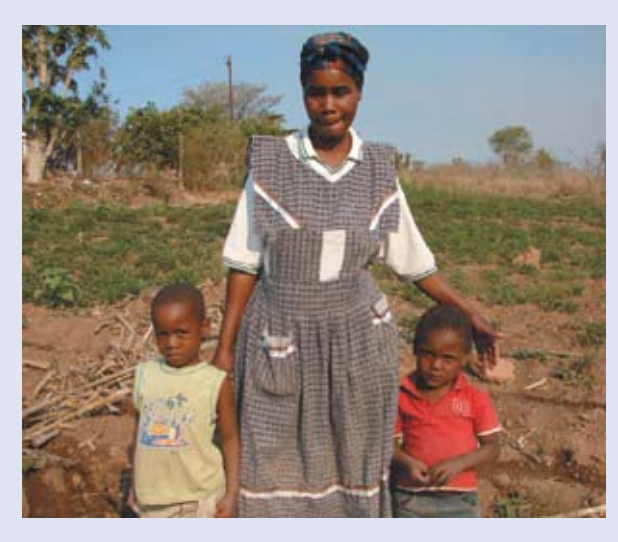
Mother and children were resettled by Maguga Dam, but they say they are happy with their new life.

ownership" within the community. And the project took steps to mitigate environmental impacts as well, by minimizing the size of the reservoir and the land that would be flooded.