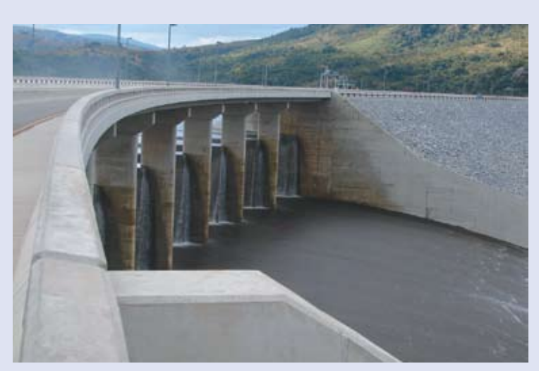
Maguga Dam, a rare example of successful resettlement from the construction of a dam.

The project authorities in Swaziland and South Africa were determined not to repeat the mistakes of other water projects like the Lesotho Highland Water Project and the Driekoppies Dam. Instead they worked to incorporate some of the WCD guidelines into the development of Maguga, such as benefit sharing. Affected communities received water, electricity, and jobs from the project, assistance with setting up farming cooperatives, and health and sports facilities. An independent dispute resolution process was established that could order the project authority to pay significant amounts to affected people. The Maguga communities were able to build their houses as they wanted. They could also decide to use part of the money they received for housing to develop businesses or purchase communal equipment, thereby spurring "positive