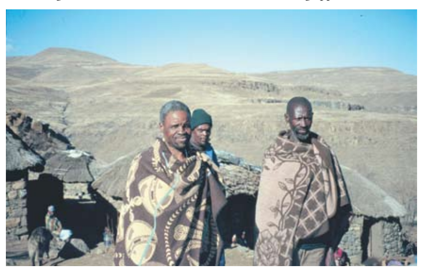
Affected people in Lesotho gather in celebration of rivers.

Penobscot River Dams, US: In June 2005, a diverse group of stakeholders participating in the FERC re-licensing process came to an agreement with the owner of PPL Corporation, the owner of several dams on the Penobscot River in Maine. This innovative agreement resulted in the formation of the Penobscot River Restoration Trust (PRRT). The PRRT was granted settlement funding and the option to purchase three Penobscot dams and remove the two lower-most dams, Veazie and Great Works. The PPL Corporation also agreed to decommission the Howland Dam and install a state-ofthe-art fish bypass, as well as to improve fish passage at four additional dams. These measures will restore 1,000 miles of historic habitat for native fish, renewing opportunities for the