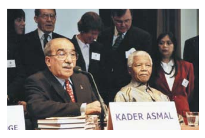
Nelson Mandela and WCD Chair Kader Asmal launch the World Commission on Dams final report in 2000.

With support from the World Bank and the International Union for Conservation of Nature (IUCN), the independent World Commission on Dams (WCD) was created in May 1998. Its mandate was to review the development effectiveness of dams and develop standards and guidelines for future projects. The Commission consisted of 12 government, industry, academia, and civil society representatives and was chaired by South Africa's water minister, Kader Asmal.