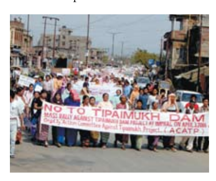
In 2006, thousands rallied in Manipur, India, to protest the government's decision to follow through with the Tipaimukh Dam.

2006. In 2008, the Sudanese government closed the gates of the Merowe Dam to flood out thousands of people who have resisted displacement from their villages in the Nile Valley. The government has also closed the region to aid agencies attempting to get relief supplies to the flood victims. No public consultations have been carried out and