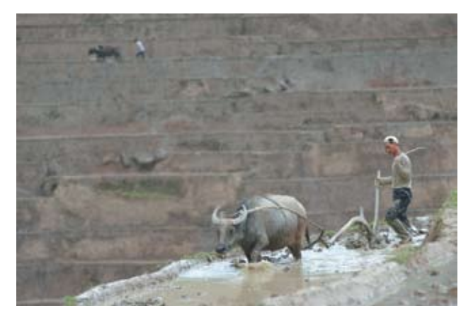
Plowing rice paddies in the future reservoir area of Xiaowan Dam on the Lancang River.

Lancang River Dams, China/Burma/Thailand/Laos/Cambodia/ Vietnam: The Lancang River begins in the Tanggula Mountain Range on the Qinghai-Tibet Plateau in China's Qinghai Province, and becomes the Mekong River as it travels through Laos, Burma, Thailand, Cambodia and Vietnam. More than 60 million people depend on the river and its tributaries for food, water, transport and many other aspects of their daily lives. The Mekong also supports one of the world's most diverse fisheries. However, China's construction of dams and a navigation channel along the upper reaches of the Mekong threatens this complex ecosystem. Development of an eight-dam cascade is already well underway, with four dams completed and two more currently under construction. The scheme will drastically change the river's natural flood-drought cycle and block the transport of sediment, affecting ecosystems and the livelihoods of millions living downstream. Construction