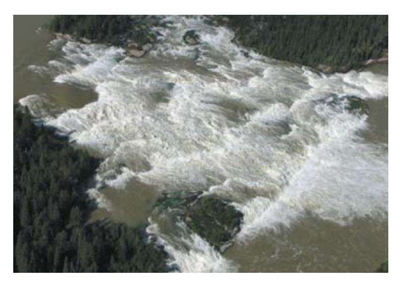
Burntwood River, site of the Wuskwatim project.

Despite its positive relationship with the NCN, the Wuskwatim Dam has other shortcomings. The Asatiwisipe