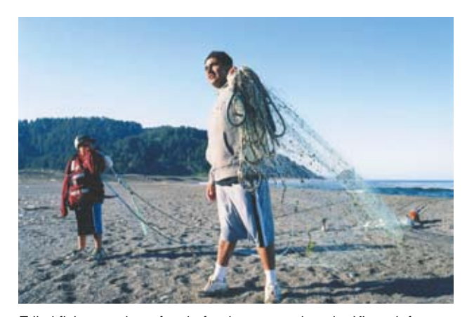
Tribal fishermen have fought for dam removal on the Klamath for years.

Klamath River, US: In January 2010, a diverse group of stakeholders from 26 organizations in the region agreed to remove four dams on the Klamath River. While the final decision must be approved by California voters, Klamath could become the biggest dam removal in the US and possibly the world. Back in 2001, the Klamath River was known as one of the most contentious river basins in the country, deeply dividing California and Oregon into two camps, with commercial fishermen and Native Americans on one side and ranchers and farmers on the other. FERC