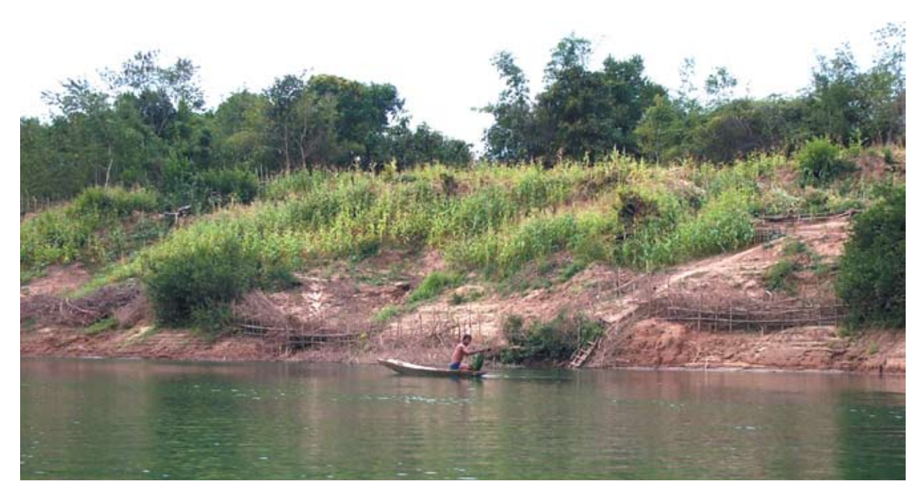
Riverbank gardens along the Xe Bang Fai that are now being affected by Nam Theun 2.

Nam Theun 2, Laos: The World Bank-backed 1,070 MW Nam Theun 2 hydropower project in central Laos displaced more than 6,200 indigenous people from the reservoir area and will cause significant impacts on more than 100,000 villagers downstream. While Nam Theun 2 has a number of mechanisms on paper to ensure compliance with social and environmental commitments, these mechanisms have not been adequately enforced. Many villagers lost land and other assets to project construction activities, but had to wait—some for more than two years—for compensation and income restoration. Despite this violation of project agreements and World Bank policies, penalties were not enforced. In March 2010, Nam Theun 2 began full operation in violation of legal obligations to provide compensation and livelihood restoration to affected communities. Commercial operations started before resettled communities received irrigated land and before downstream communities received alternative water supply sources and compensation for flooded riverbank vegetable gardens, to which they are legally entitled.