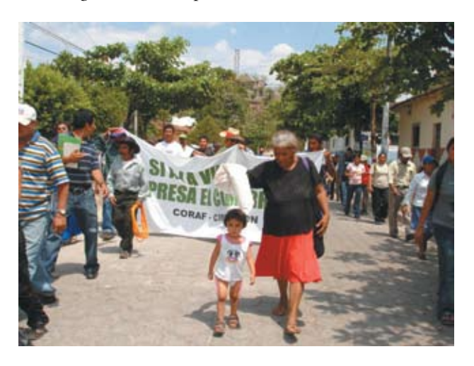
Organizations and communities in the municipality of Texistepeque gathered for a forum entitled "Free Rivers, Free Communities" in 2008 for the protection of the Lempa and Torola Rivers.

Chimanimani and Gwanda Districts. Zimbabwe: Under the legal frameworks of the 1998 Rural District Councils Act and the 2000 Traditional Leaders Act, which allow for decentralized planning and needs assessments on the level of individual villages, the districts of Chimanimani and Gwanda undertook a process called Community Based Planning (CBP) to determine their needs and options for water and food security. The CBP process, which is a decentralized, bottom-up approach meant to build on local resources and capacities, established a needs assessment for water that included a description and ranking of community-level options. Rather than proposing a centralized development project such as a dam, the assessment concluded that household-level water harvesting and soil conservation technologies were the optimal solutions.