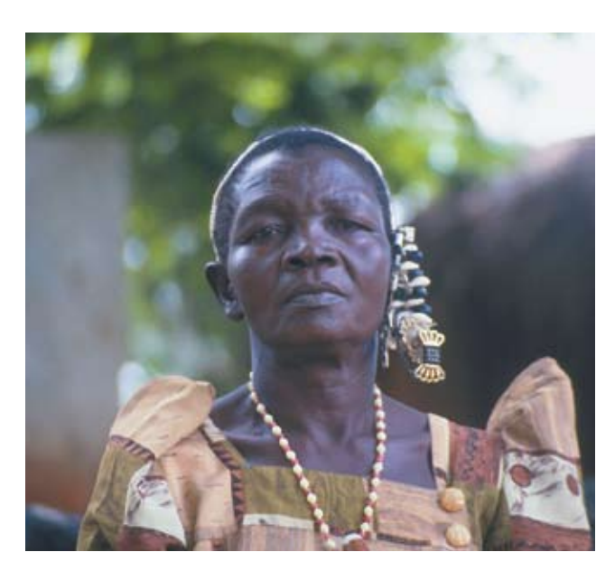
Local environmentalists see this project as doing little to help the 95% of Uganda's population who are not connected to the national grid.

exist that would be quick to implement and well-suited to the country's decentralized energy needs. A 1999 feasibility study for Mphanda Nkuwa failed to assess the country's priority needs, such as rural electrification, and to take into account non-hydro options. In 2009, Maputo-based environmental