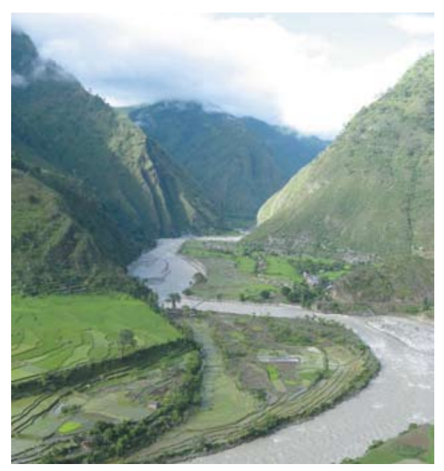
The Seti River in Western Nepal is site of the planned 750 MW West Seti Hydropower Project. Despite the success of small hydro, the Nepali government is still looking for investors and financiers for several large dam projects including West Seti and Arun III.

Small Hydro, Nepal: In the 1990s, frustrated by the high costs-including financial, social and environmental-of big, foreign-led hydro projects like the proposed Arun III (a