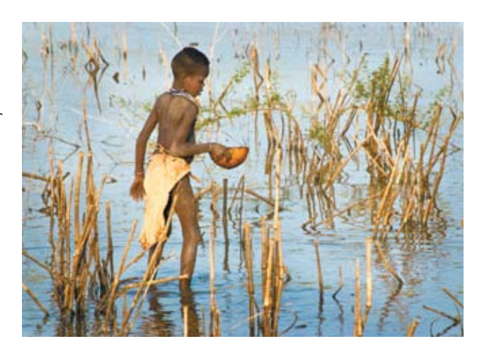
A Karo boy collects water from the Omo River floodplain in Ethiopia, downstream of Gibe 3 dam.

was built to divert water from the Ganges River into the Hooghly River during the dry season and flush out the accumulating silt. In Bangladesh, the diversion has raised salinity levels, contaminated fisheries, hindered navigation, and posed a threat to water quality and public health as it cuts off the river's water supply to that country. Lower levels of soil moisture along with increased salinity have also led to desertification. India and Bangladesh have negotiated several agreements regarding environmental flows from the Farakka Barrage, but India has so far not complied with any of them.