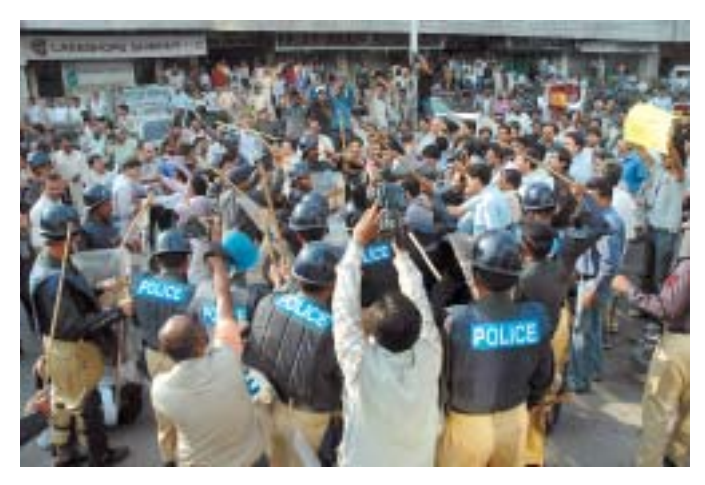
Force against freedom: A melee erupts in Karachi as police use batons against journalists demanding freedom of the media after the imposition of a state of emergency.

Pakistan, or "defame" the administration or the army. Anything deemed vulgar or obscene, and anything that promoted "ethnicism", was also banned.