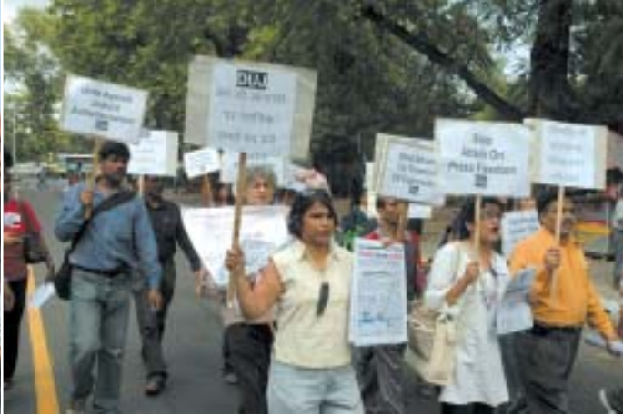
Investigative journalism fettered: Outside India's Supreme Court, three journalists and the publisher of Midday speak out against their conviction for "contempt of court". Right, Delhi Union of Journalists and other organisations protested against the judicial ruling.