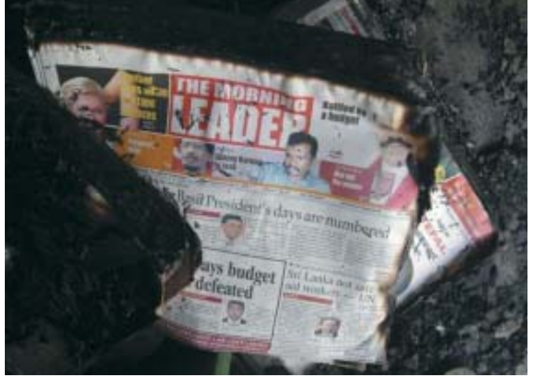
Sri Lanka under attack: The printing press of Leader Publications, one of Sri Lanka's major printing houses, was set alight and completely destroyed in an arson attack by an unidentified gang on November 21, 2007.

the democratic transition. The persistence and patience of the diverse parties engaged in this transition have paid off in the historic general elections held on April 10. 2008. to create a Constituent Assembly that will determine the contours of the country's future political evolution. The media community, as an active agent of the process of democratisation, has acquired sufficient moral capital to ensure that strong free speech guarantees and assurances on the public right to information are enshrined in the