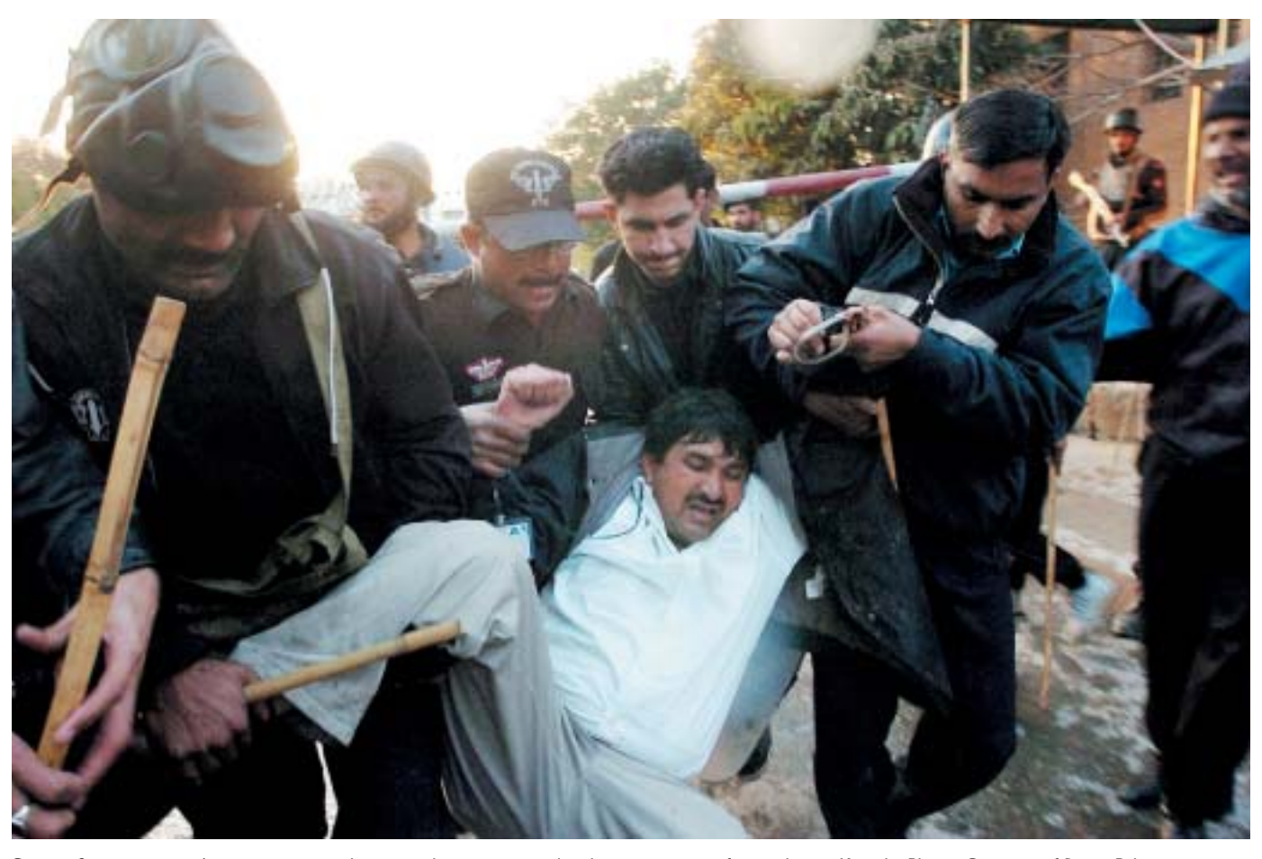
State of emergency: Anti-terrorist squad personnel arrest a journalist during a protest of journalists in Karachi.

Tensions became acute, culminating in the imposition of emergency rule in November 2007. Two amendments to