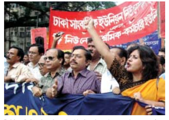
Raising their voices: Journalists' leaders shout slogans in the streets of Dhaka demanding rights for journalists on June 22, 2007.

There have been instances when media reports on a matter of immense public importance for Bangladesh - the supply of essential agricultural inputs such as seeds and fertiliser - have also attracted the emergency administration's ire. On November 13, Industries Adviser Geeteara Safiya Choudhury blamed "propaganda" for