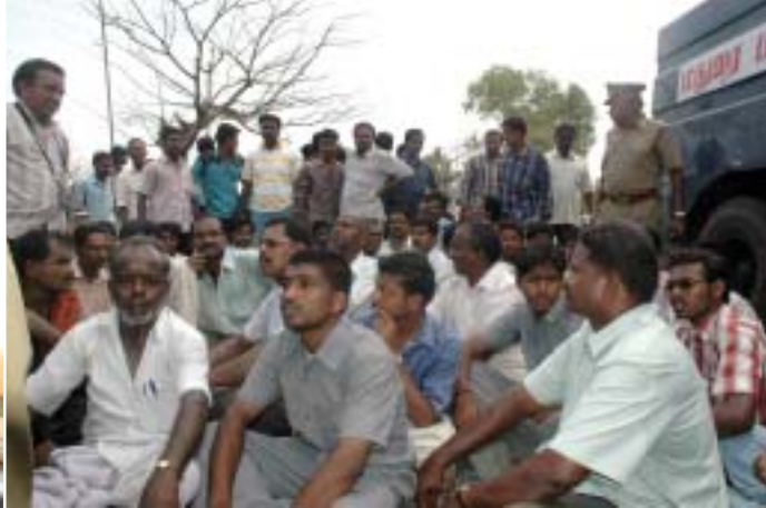
Political faction fight triggers arson: Fire services personnel at the office of the Dinakaran newspaper in Madurai after an arson attack in May 2007 that killed three media workers. Right, staff of Dinakaran in a demonstration demanding prompt action against the culprits.

In the absence of a transparent regulatory