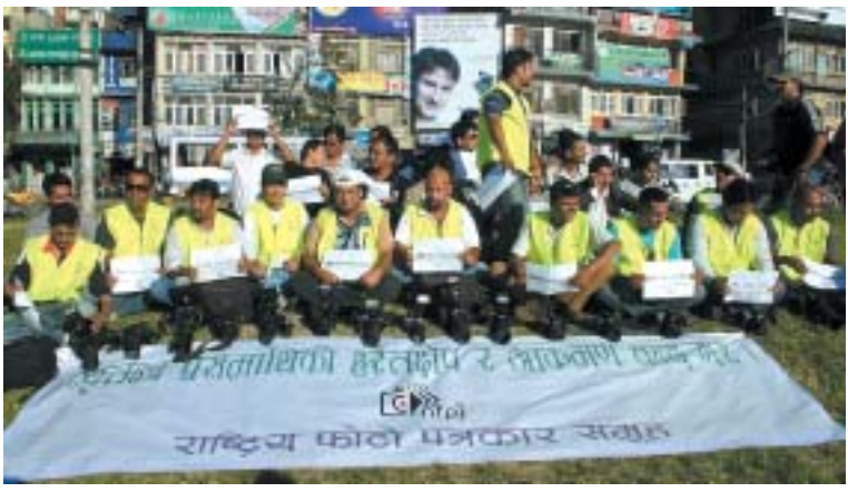
Freedom in focus: Photographers of the National Forum of Photo Journalists stage a sit-in protest for press freedom at Maitighar Mandala, Kathmandu.

FNJ reports of journalists being threatened in their attempts to obtain information illustrate that Nepal remains far from enjoying a safe and free media. Nepal's independent media was disrupted throughout August 2007 by serious setbacks, including the halt of printing and distribution of daily newspapers such as the Himalayan Times and Annapurna Post and the threatened closure of HBC FM radio station by Maoist-aligned unions.