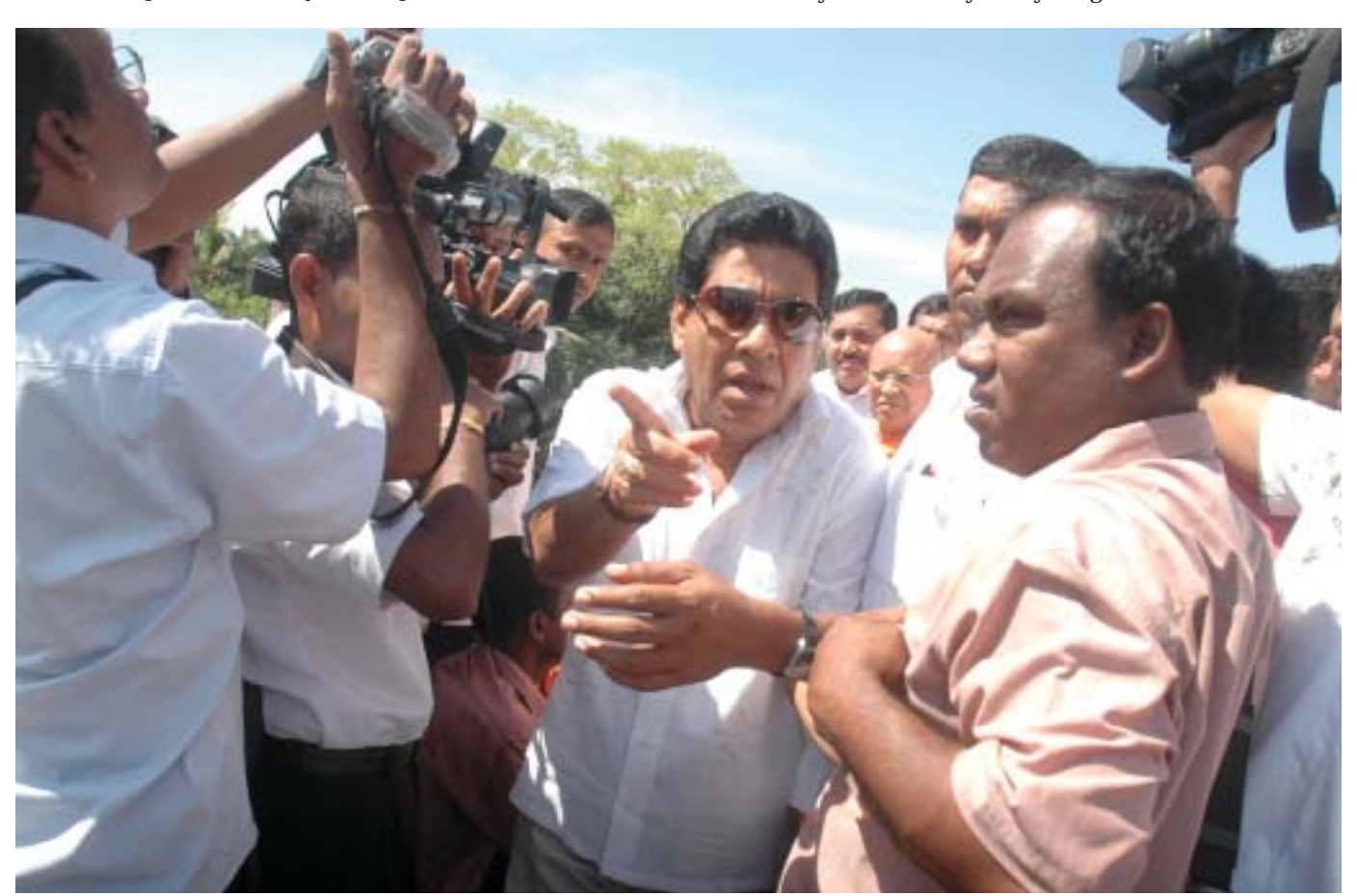
Ministerial misconduct: Labour Minister Mervyn Silva abused media personnel in front of a leading prelate and ejected them from a function in Kelaniya on April 10, 2008.