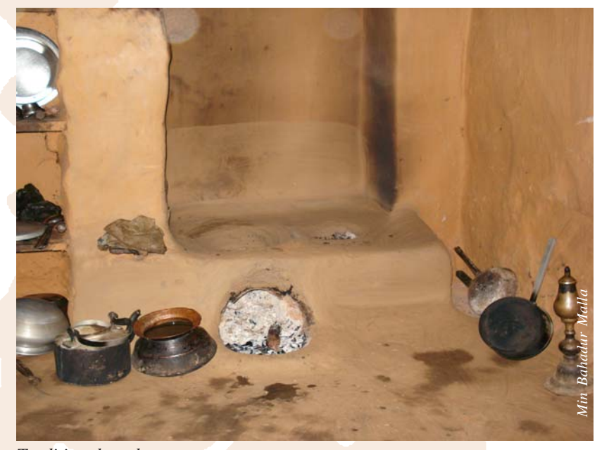
Traditional mud stove

This policy brief is an output of a research project funded by SANDEE. The view's expressed here are not necessarily those of SANDEE's sponsors.