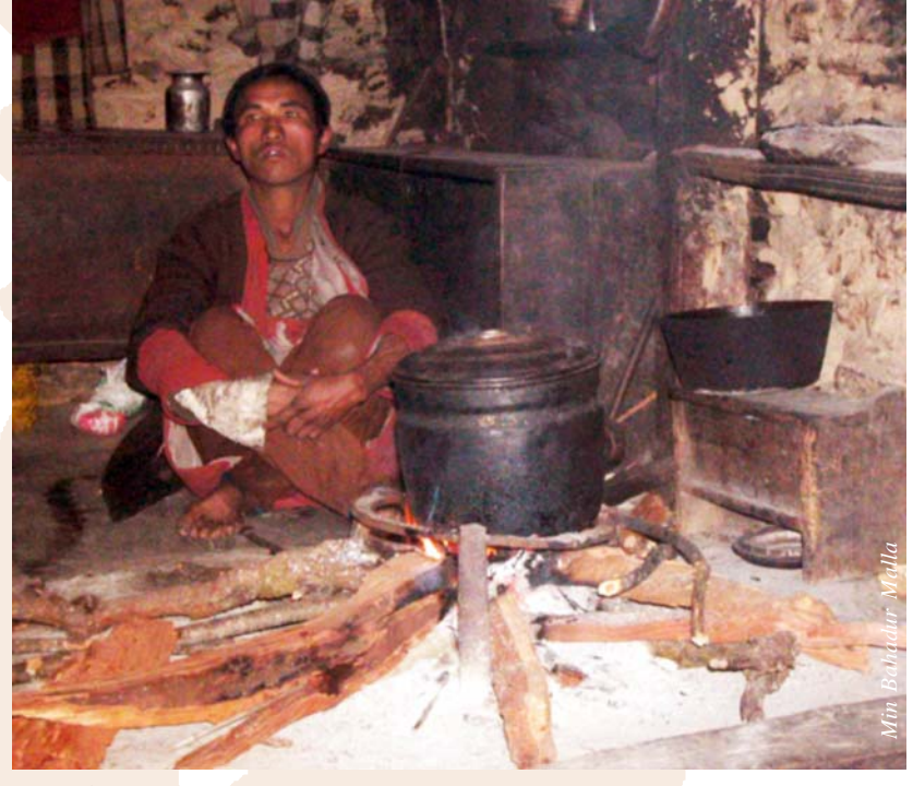
Open fire stove

Even though this study calls into question the effectiveness of improved stoves at reducing firewood use, it should be remembered that they do have other benefits. Many studies have confirmed that improved stoves reduce PM_{2.5} and CO pollution, improve indoor air quality and significantly help to reduce the incidence of respiratory diseases.