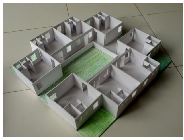
A sample design plan of the interiors.