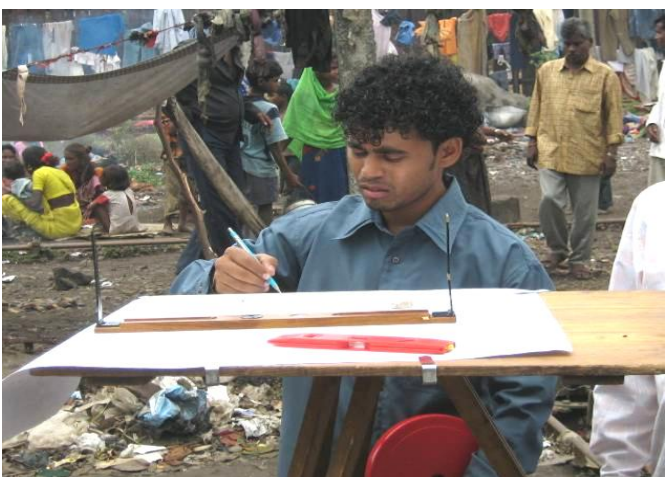
A Formal Plane Table Survey shows a scale map of all the structures in the existing settlement.