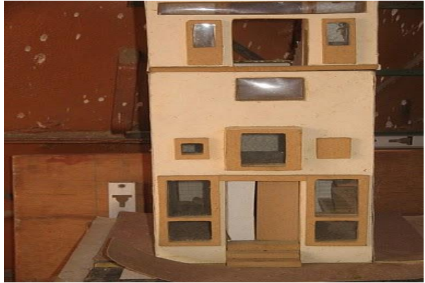
A model block layout design made in a community housing workshop.